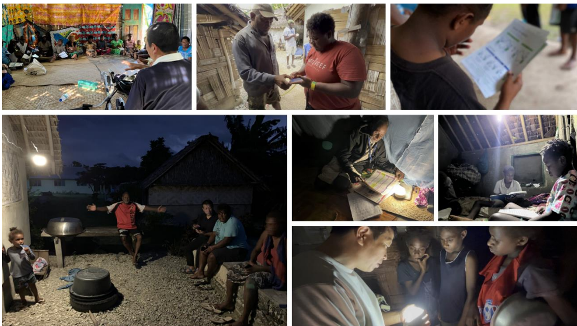
Service Scenes in Vanuatu through DEP

Going forward, Toshiba, Vanguard Industries, and Kyowa Shipping plan to explore expanding Radiant Technologies' scope of business to additional regions within Vanuatu and to other developing countries. This effort aims to build inclusive infrastructure and to help realize a prosperous, sustainable society for all.